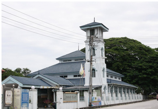
Figure 4: Paloh Mosque