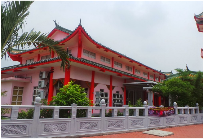
Figure 9: Chinese Mosque, Ipoh, Perak