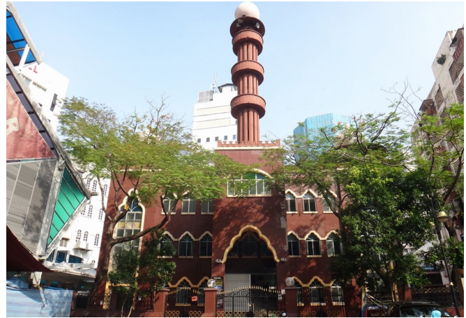
Figure 5: India Mosque, Kuala Lumpur.

On this account, mosques were widely constructed throughout the country not only by the colonials but also by influential individuals in society and private da'wah groups using available capacity (Ahmad 1999; Nasir 1984). Nevertheless, the individual funded mosques are very basic in shape using wood and concrete (Ismail, A.S., 2008). These type of mosque are located in rural areas to cater for locals and villagers. The type of mosque they produced typically portrayed the traditional typology outlook and is smaller in scale compared to the royal mosque (Rahman, 1998).