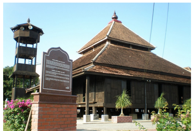
Figure 1: Kampung Laut Mosque