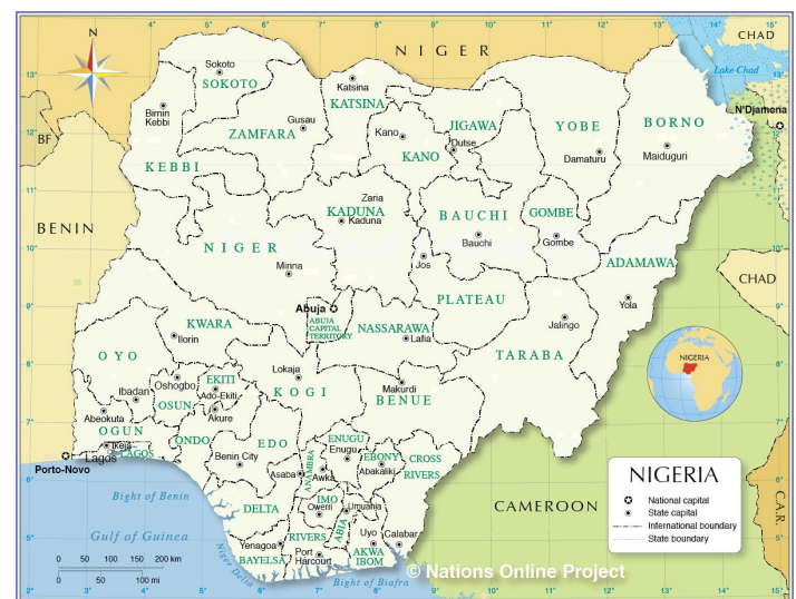
Figure 1: Map of Nigeria

Benin City is the capital of Edo state, a sub-national unit of the Federal Republic of Nigeria (Figure 1). It is geographically located in the tropical equatorial zone with an average temperature of 27 degrees centigrade, a wet season lasting from March to October and a dry season (with dry, dusty and cold Harmattan winds) from November to February. The vegetation is thick rainforest, rich in hardwoods such as the Iroko and Obeche, which is the source of raw material for the thriving carving and furniture industries which, together with bronze casting, ivory-carving, weaving and hunting constitute important traditional occupations. Other occupations and economic activities are primary, secondary, tertiary and quaternary in category. Within this