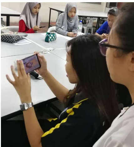
Figure 3 Student's using AR application during demonstration