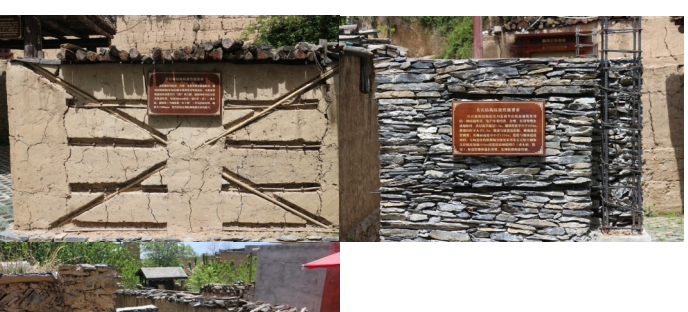
Figure 8 Applied technology and materials in new Luobo Village

built as national culture displaying space, and most of the rest houses are reconstructed as folk inns for tourism.