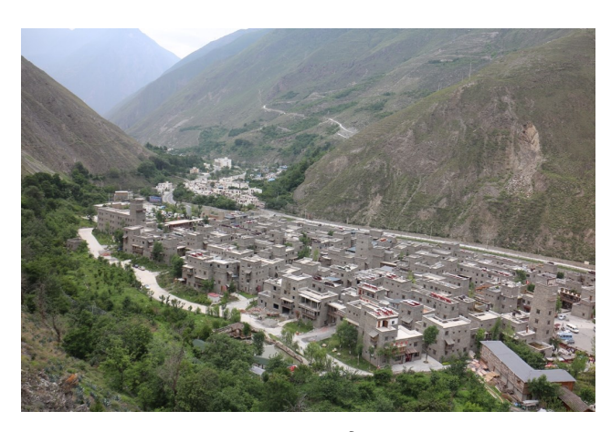
Figure 14 Settlement Pattern of new Taoping Village

houses in the old village. Most of the houses in new village are constructed by traditional technology with Sheet stones and cement mortar, while some of the new houses were built with bricks.