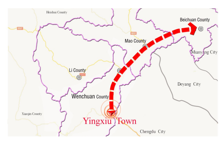
Figure 2 Center of Wenchuan earthquake

The research is aimed at the changing progress of Qiang's settlements landscape. After preliminary investigating the settlements in upper reaches of Minjiang River, five couples of settlements are chose to indepth investigation according to the classification of settlements rebuilt. They are Buwa Village, Luobo Village, Xiuxi village, Taoping Village and Aer Village (Figure 3). These settlements are located in different alpine valleys in upper reaches of Minjiang River. They all had complete