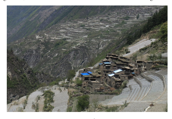
Figure 9 The pattern of old Xiuxi Village

The old village has not clear boundaries and the villager's cultivated land is around the houses. On the contrary, there is a gate built as a clear symbol in front of the new village. The villagers all have strong territorial consciousness to their villages, forest and cultivated land. The narrow alleys in old village are composed of two groups, one parallels the contour and another is vertical to the contour (Figure 11). The roads in new village are wider. A four meters wide road was constructed through the village, while several alleys lead to every house. There is not any open space for public activities in old village. However, there is a square in the center of the new village and a parking lot on the edge (Figure 12). The houses built with sheet stones in old village were all