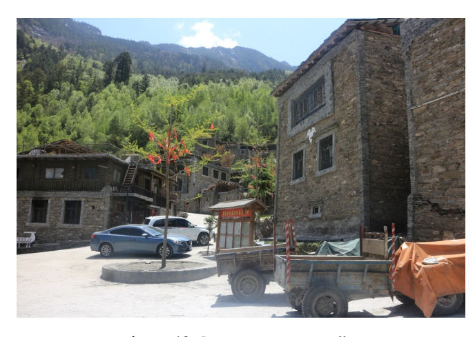
Figure 12 Square in new Xiuxi Village