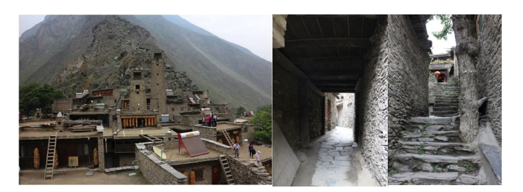
Figure 15 Spaces in old Taoping Village

The old Taoping Village center is on the three high towers. The house lay-out compactly embodies a strong integrity and cohesion. According to the historical data, defense was considered to the most important faction at the beginning of construction. The villagers took measures adapted to terrain conditions when they built their houses, so the old village shows irregular form but integrated so closely with the slope as an organic whole (Figure 13). The new village located in the open ground near the old village was constructed with unified planning after the earthquake, so the new houses arranged in parallel are orderly and regular (Figure 14).