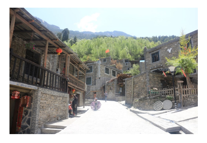
Figure 10 The houses in new Xiuxi Village