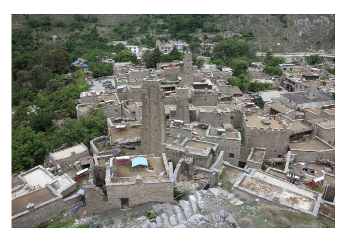
Figure 13 Settlement Pattern of old Taoping Village

connected with each other. Most of the houses in new village are independent and have gap between each other.