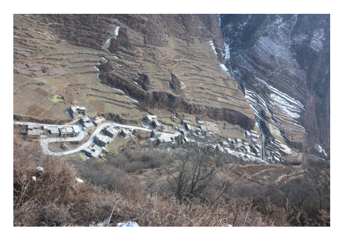
Figure 18 The new Aer Village