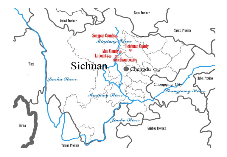
Figure 1 Minjiang River and the main location of Qiang

reconstruction of the settlements have been kept doing. The modern design technique, construction technology and the new materials have been used to reconstruct the settlements. In the process of reconstruction, the traditional culture of Qiang ethnic group has encountered the foreign culture. Because of it, landscape changes have taken place in Qiang's settlements during the process. It is significant to study on the landscape changes in Qiang's settlement for the dynamic protection and cultural heritage of Qiang's traditional settlements.