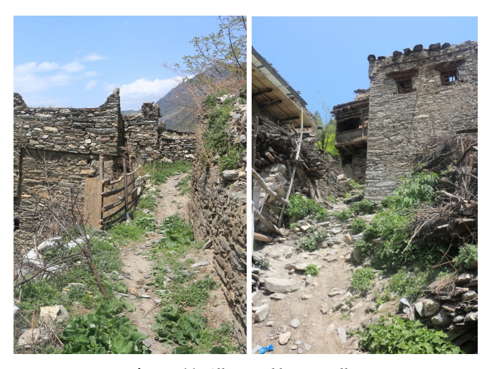
Figure 11 Alleys in old Xiuxi Village