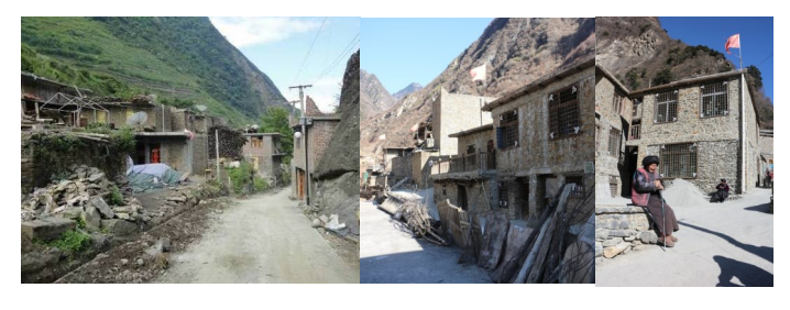
Figure 19 Houses at the new Aer Village