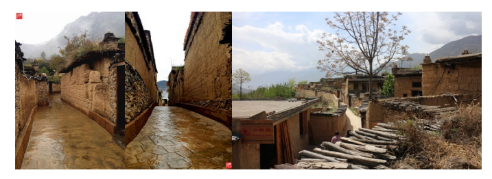
Figure 7 The alley and houses in new Luobo Village

The form of new village is similar roughly as the original one, but it has hardly defensive faction, while it represents lower cohesion and integrity than the original one. New Luobo Village constructed for tourism is composed of three parts: inns, national culture Museum (Figure 6), earthquake ruins. Some houses destroyed in the earthquake are retained as a memorial landscape, some houses are