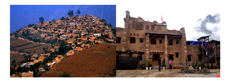
Figure 5 The Old Luobo Village (left) . Figure 6 Museum in Luobo Village (right)

Luobo Village is a typical settlement rebuilt to traditional forms in original location. Some houses and spaces were restored partly after original settlement was researched in depth. According to different historical periods and different degree of damage, 10 houses were selected to be models. Unified approaches of restoration and