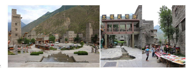
Figure 16 Spaces in new Taoping Village