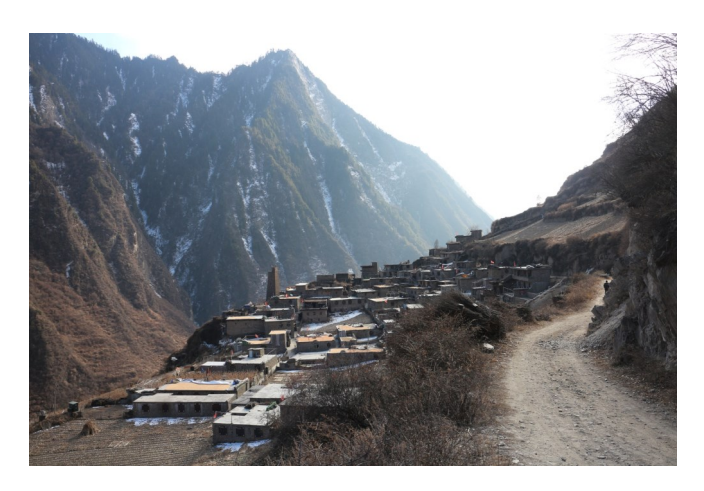
Figure 17 The old Aer Village